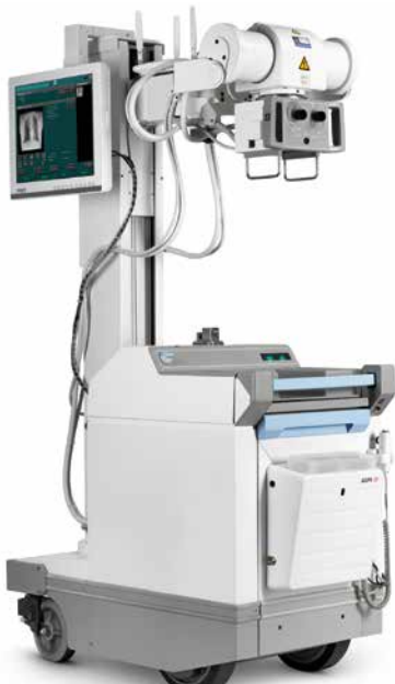
DX-D Mobile Retrofit