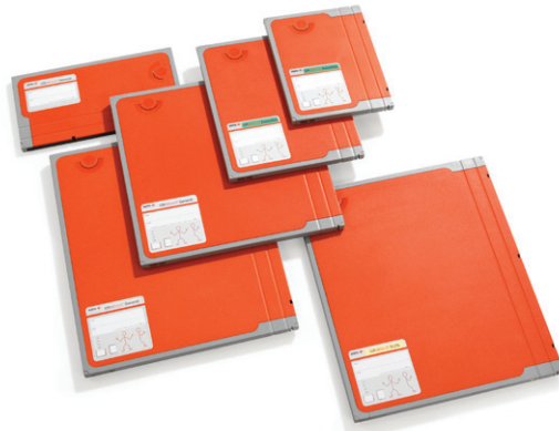
General radiography, Extremities, FLFS: imaging plates and cassettes