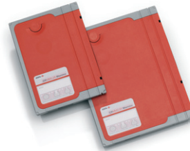
Mammography: imaging plates and cassettes